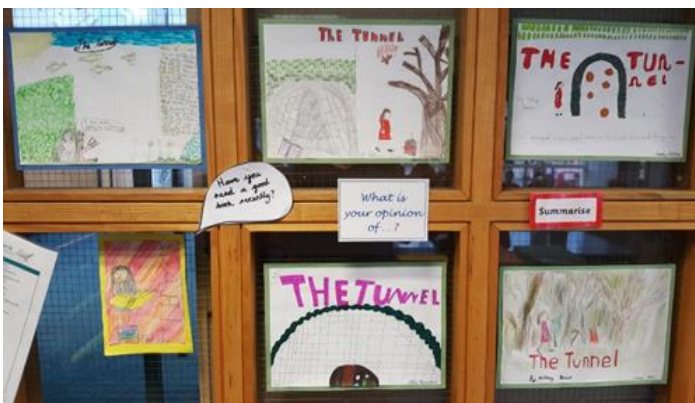
Celebration work in Year 4, surrounded by essential vocabulary.