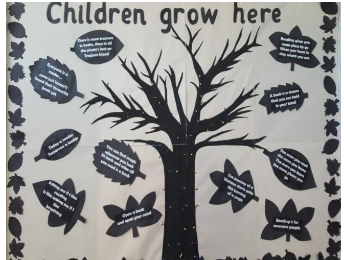
Motivational quotes in Year 5.