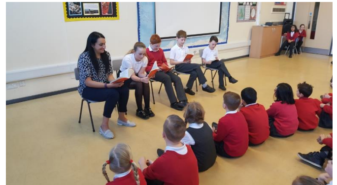
Year 6 sharing their favourite book in assembly.