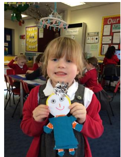
Reception have been making puppets of their favourite story character, drawing pictures and writing sentences about their favourite story, writing book reviews and of course, reading stories!