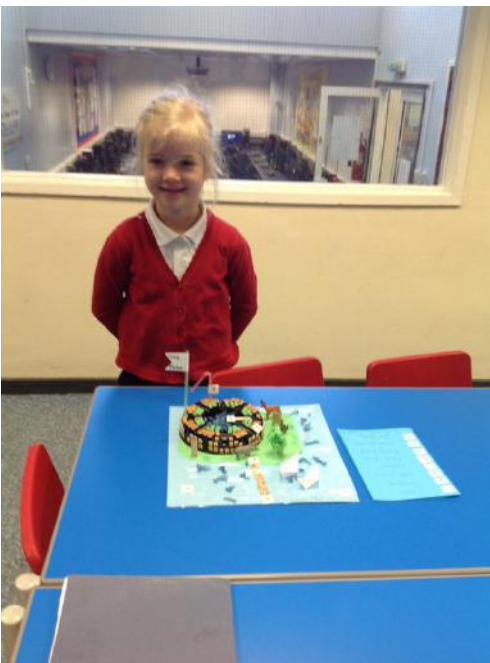
Year 2 have been producing some fantastic homework this week